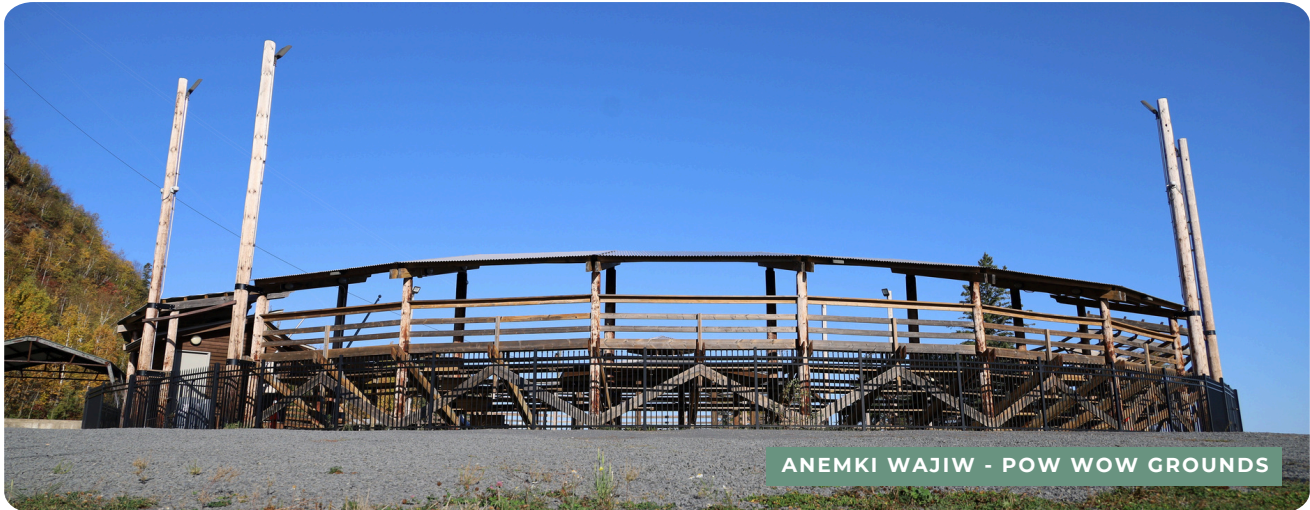
ANEMKI WAJIW - POW WOW GROUNDS