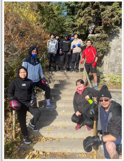
A flight of stairs on Mont Royal. We jogged up the stairs and did pad work at the top.

This November, 8 youth from Kashechewan as well as 2 NALSC Youth Intervention workers attending a boxing training camp in Montreal. The boxing training was hosted by the Donnybrook Boxing Club while jogging occurred at different places such as McDonald Park, Summit Woods, and on the third day of training camp they even ran up the stairs of Mont Royal and reached the peak. Every youth completed all of their training on this trip and in spare time did homework as well as sightseeing and shopping. They hope to continue their training from the community and someday participate in a competition.